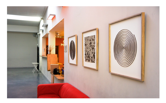
The laser cutting work exhibition.