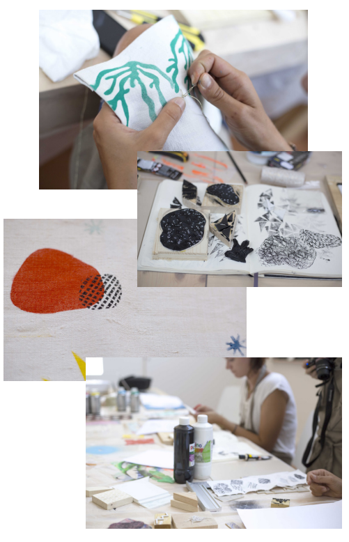
A graphic landscape with stamps #1: a workshop intended for children and adults.