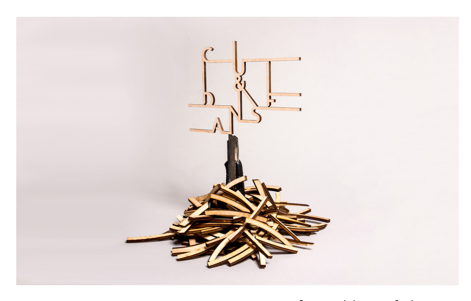
Some wood characters for the program.