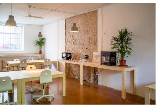
The coworking space.

Make it Marseille, with 450 square meters dedicated to creation and about 45 machines, is especially well received in a city where anything is made possible.