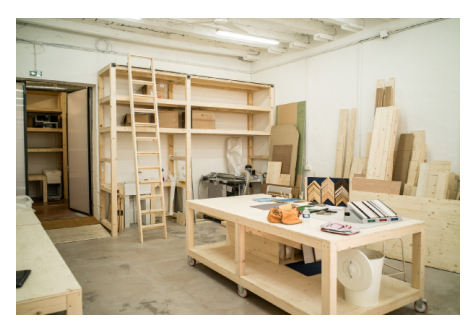
The wood workshop.